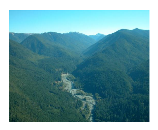
Elwha River Restoration Weather Patterns of the Pacific Coast Vocabulary Notes